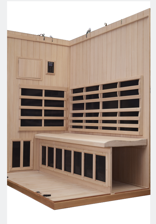
Actual Assembly - Clearlight Sanctuary 3